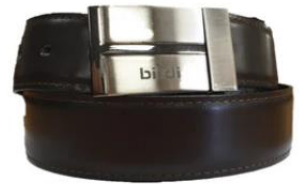
Black/Brown Reversible Buckle Belts