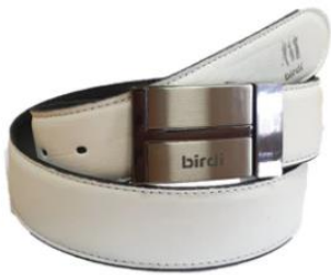
Black/White Reversible Buckle Belts