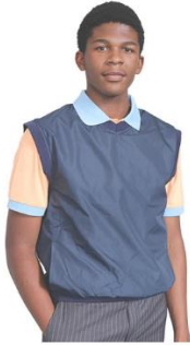
Men's Wind Shirt Navy

Birdi Clothing is back and available with Thys in the Proshop