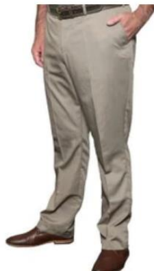
Birdi Trousers in Stone