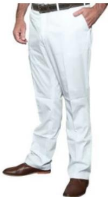
Birdi Trousers in White