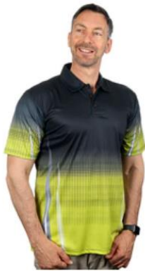
Gleneagles Black, Lime & Silver R 499.00