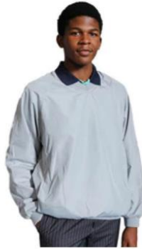
Men's Wind Shirt Grey