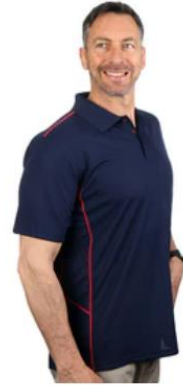
Birkdale Midnight Navy R 499.00