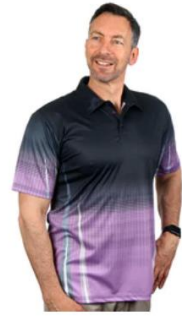
Gleneagles Black, Lilac & Silver