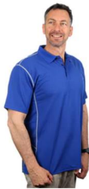
Birkdale Cowboy Royal R 499.00