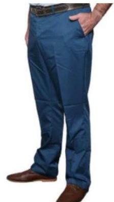
Birdi Trousers in Teal