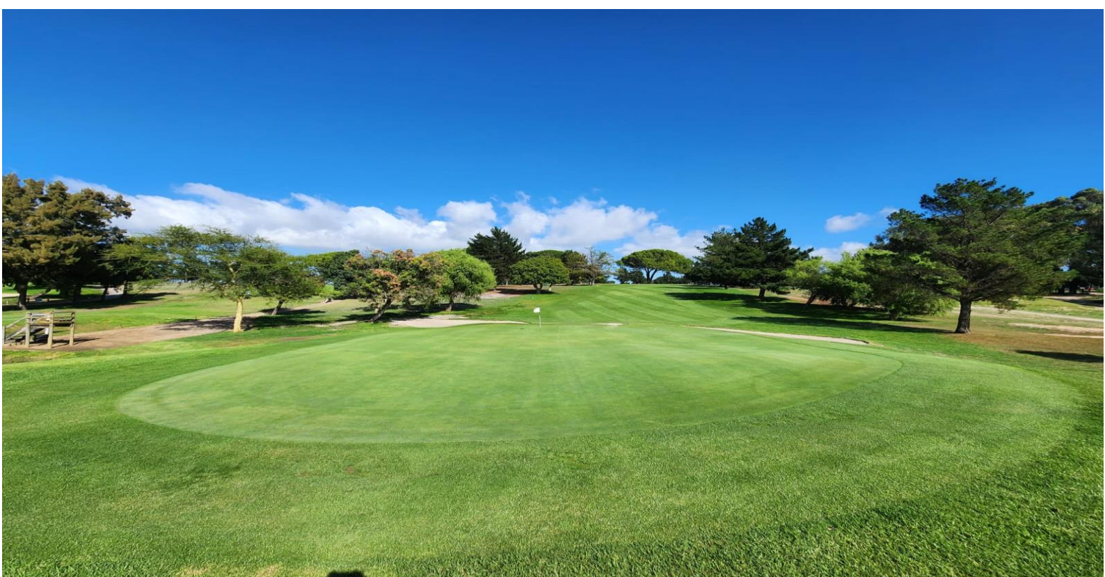
4 TH GREEN