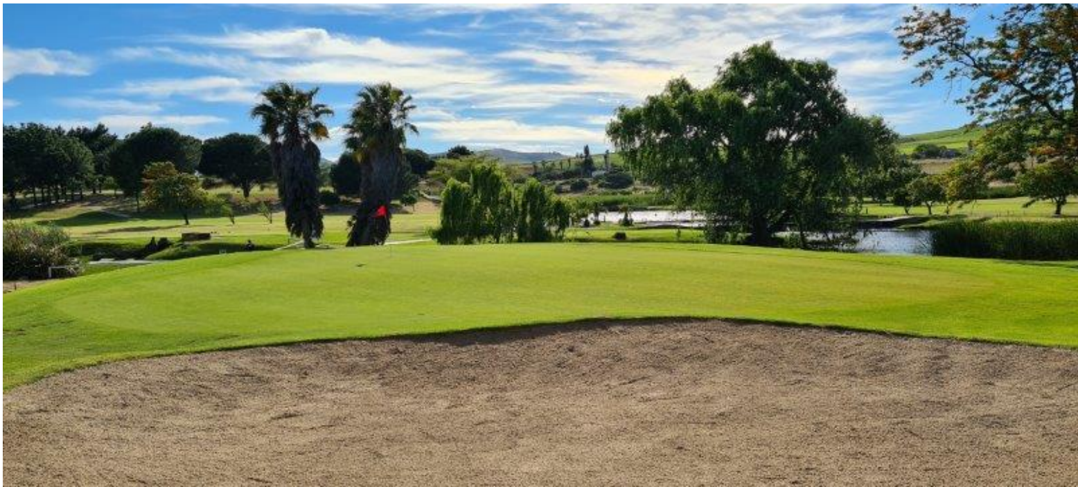
6 th Greenside Bunker After Edging