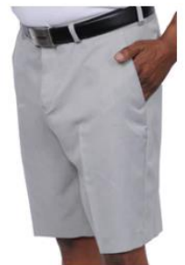
Surface Classic Silver R 499.00