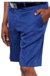
Surface Classic Indigo Blue R 499.00