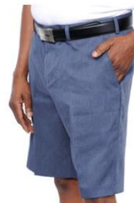
Surface Classic Cobalt Charcoal R 499.00