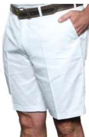
Birdi Shorts in White R 499.00