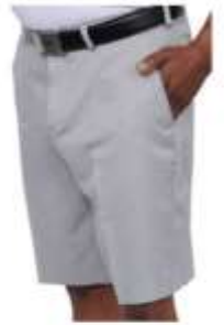
Surface Classic Silver R 499.00