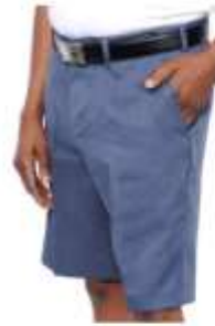
Surface Classic Cobalt Charcoal R 499.00