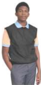
Men's Wind Shirt Black