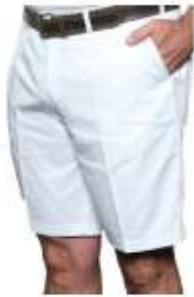
Birdi Shorts In White R 499.00