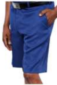
Surface Classic Indigo Blue R 499.00