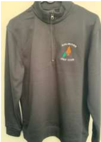
KRGC Men's & Ladies Winter Tops R650 each...